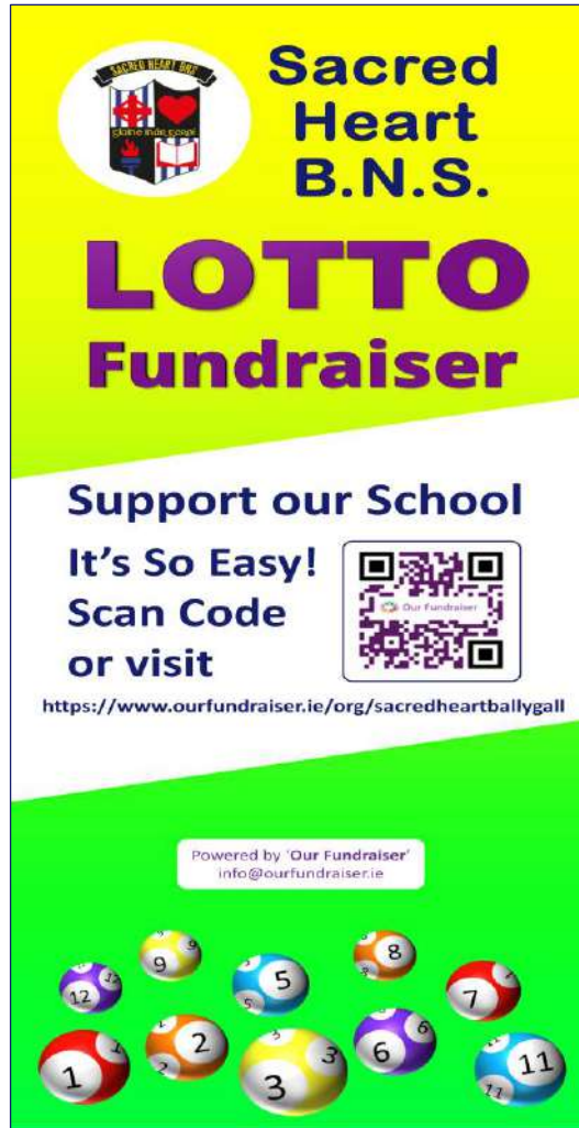
File 5 in your email

This can be printed by a local printer and usually costs circa €100 - €150.