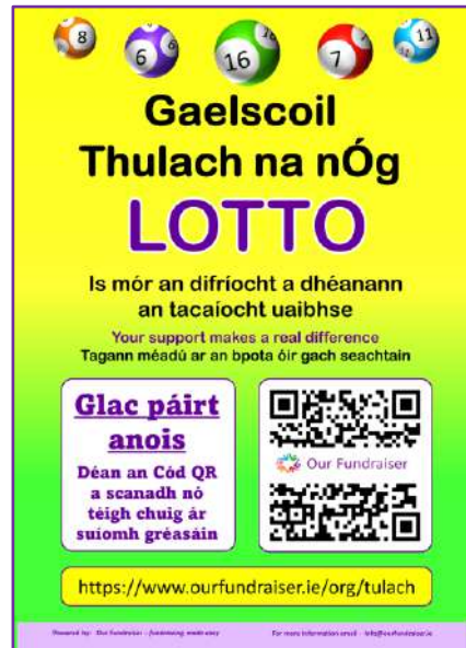
File 3 in your email

An A3 poster to be printed by the school and put up on noticeboards in the high footfall areas of your school.