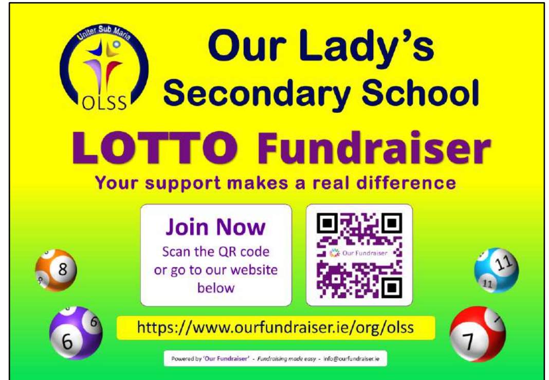
File 4 in your email

An A0 poster design ideal for school gates / railings. This can be printed by a local printer and usually costs circa €75 - €125 when printed on a corrugated board.