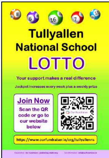
File 2 in your email

An A4 poster to be printed by the school and put up on noticeboards in local shops, churches, and banks.