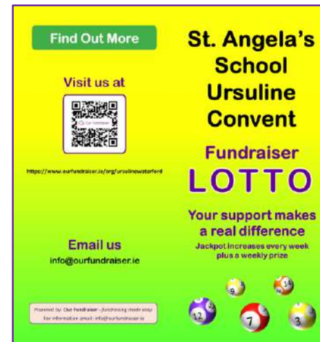
File 6 in your email

This can be printed by a local printer and usually costs circa €75 - €125 for 500.